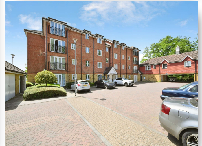
Yukon Road, Broxbourne EN10 6FP