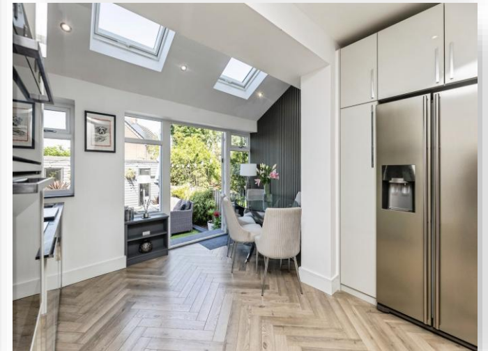
Greenfield Avenue, Morley Leeds LS27 7AH