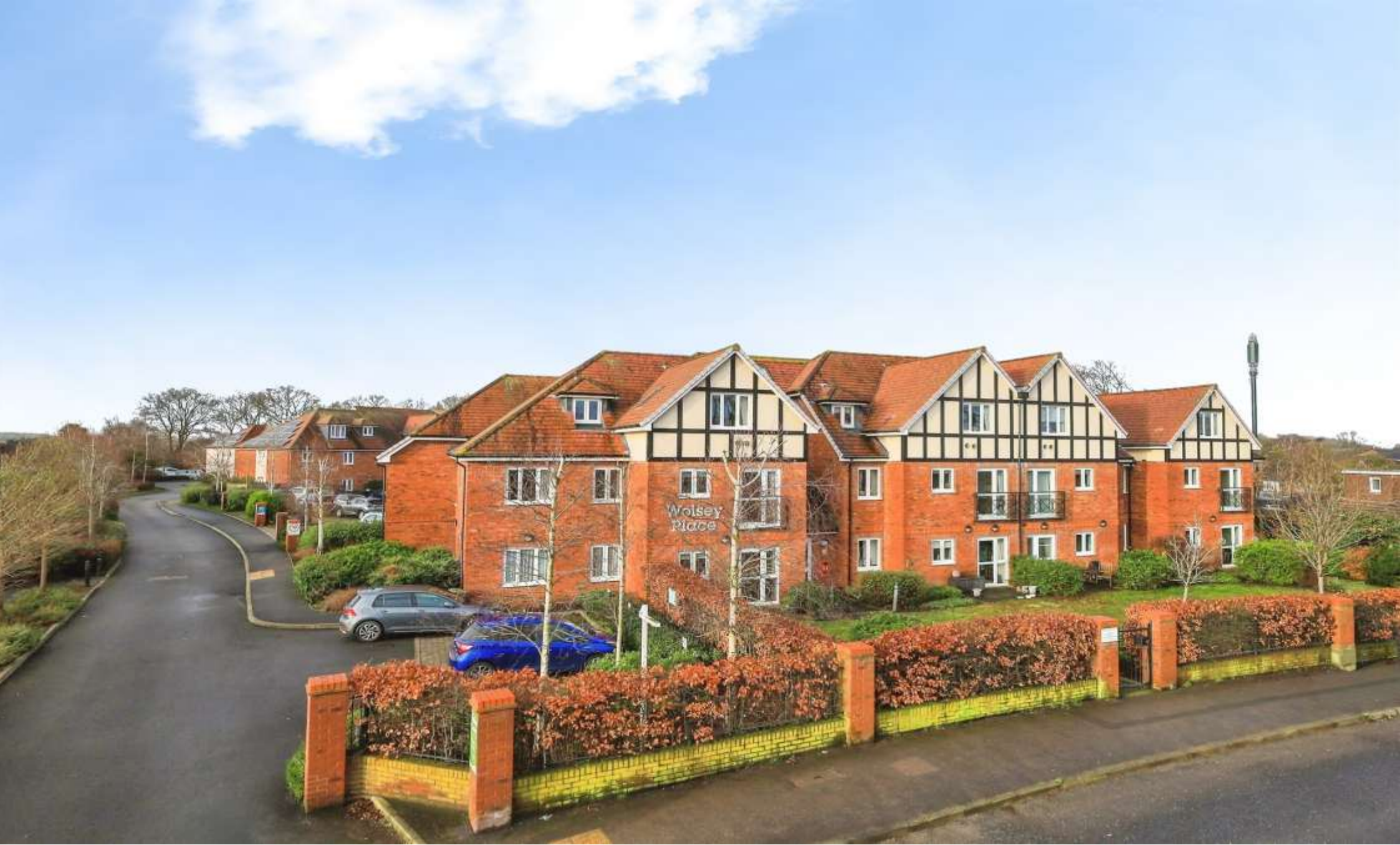
Wolsey Place, London Road, Hailsham BN27 3FU