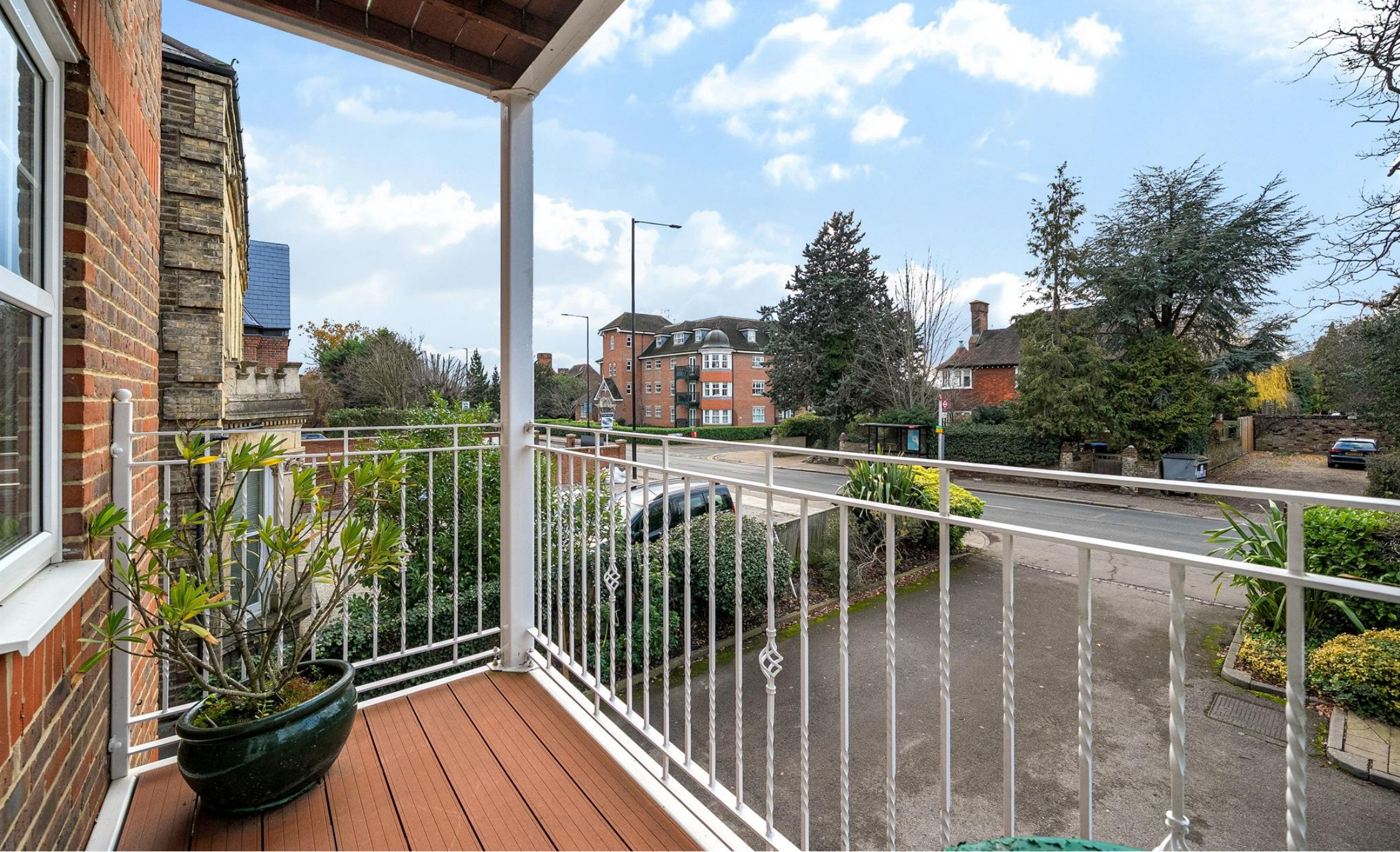
Langton Court, The Ridgeway, Enfield, EN2 8PD