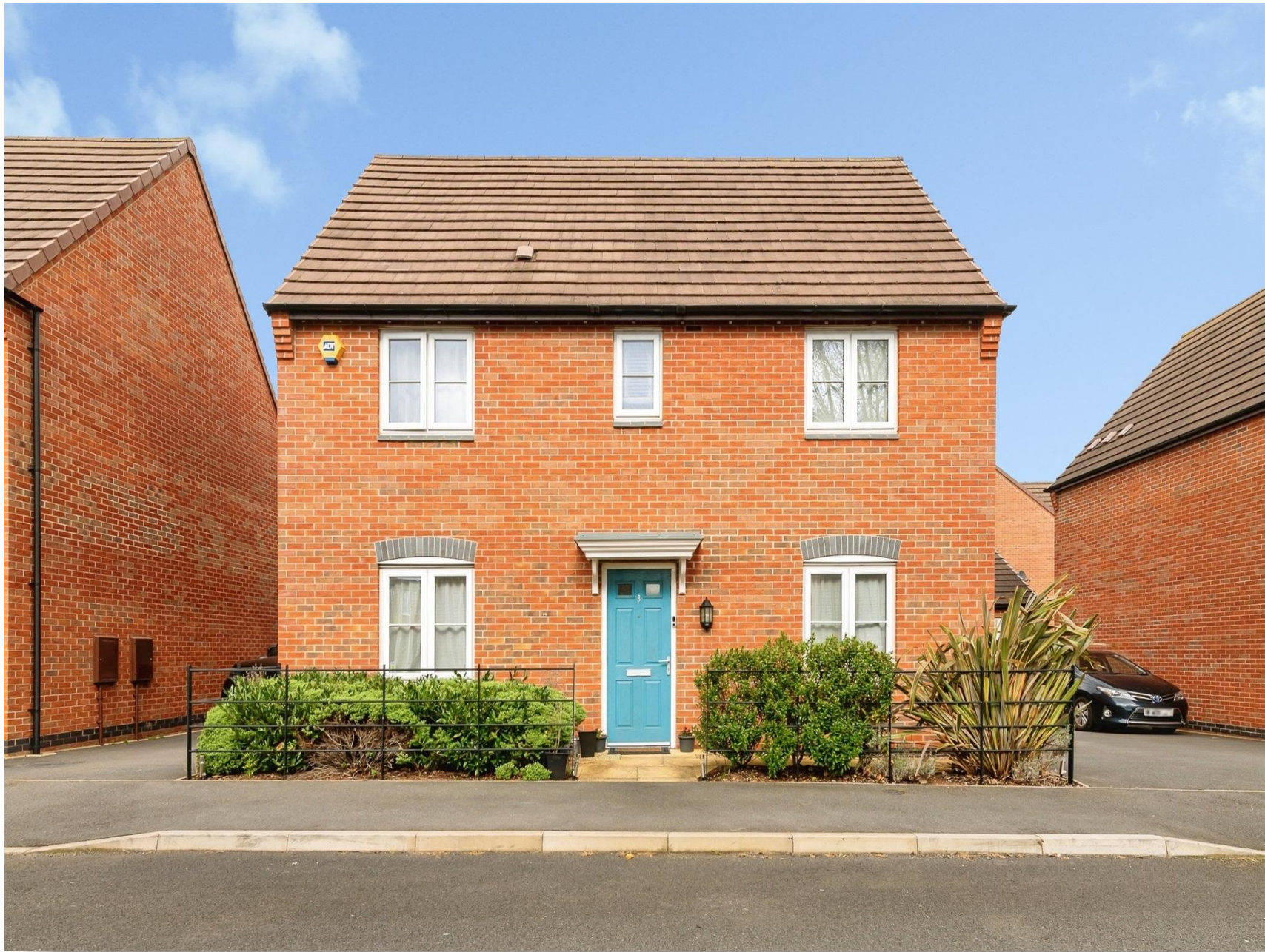
Crispin Way, Nottingham NG8 3QH