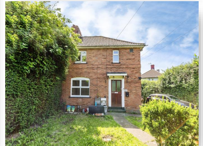
Pen Park Road, Bristol BS10 6BU