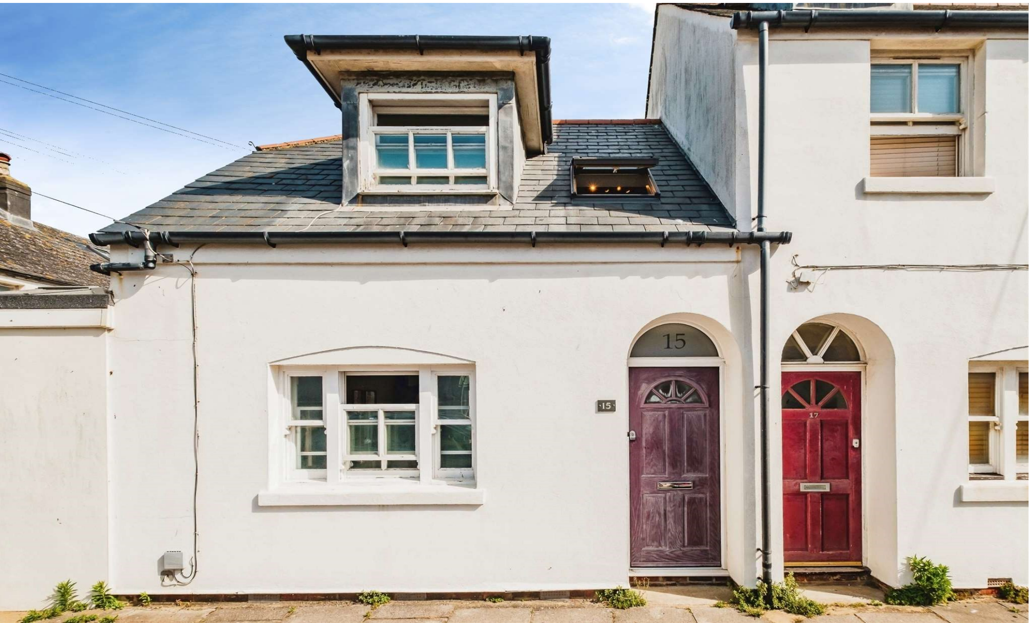
Augusta Place, Worthing BN11 3FF