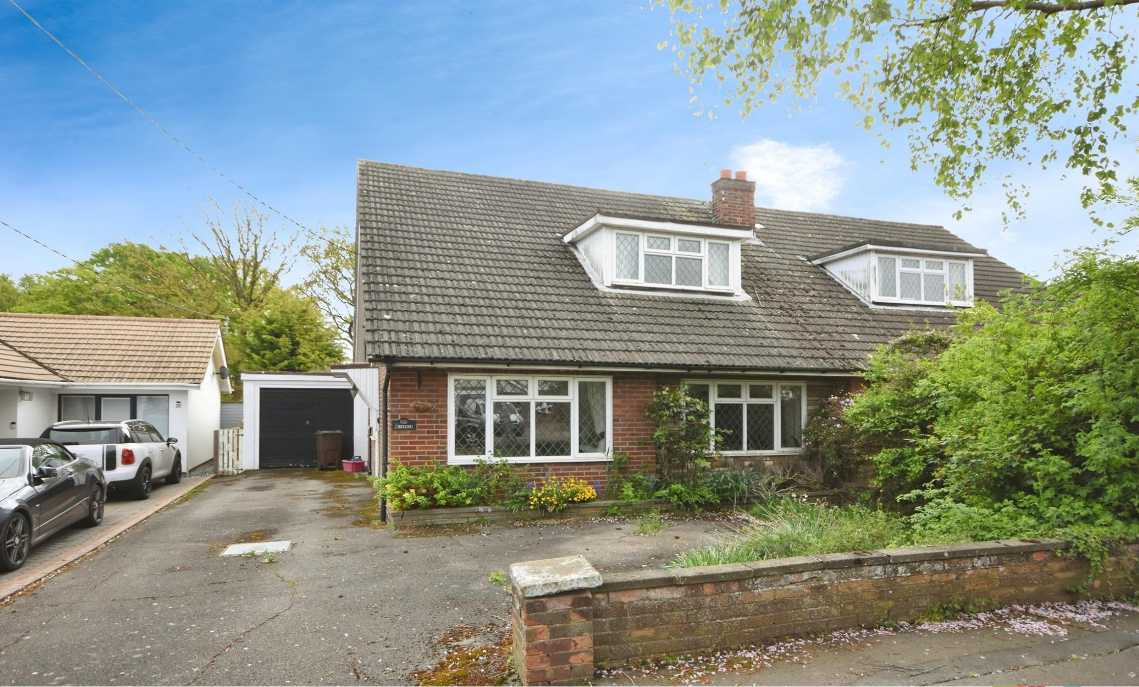
Croeso, Wyatts Green Lane, Wyatts Green, Brentwood, CM15 0PY