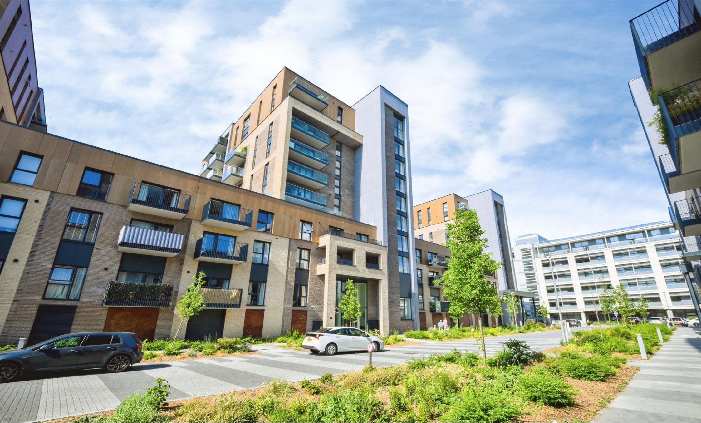
Godfrey House Edinburgh Gate, HARLOW CM20 2UF