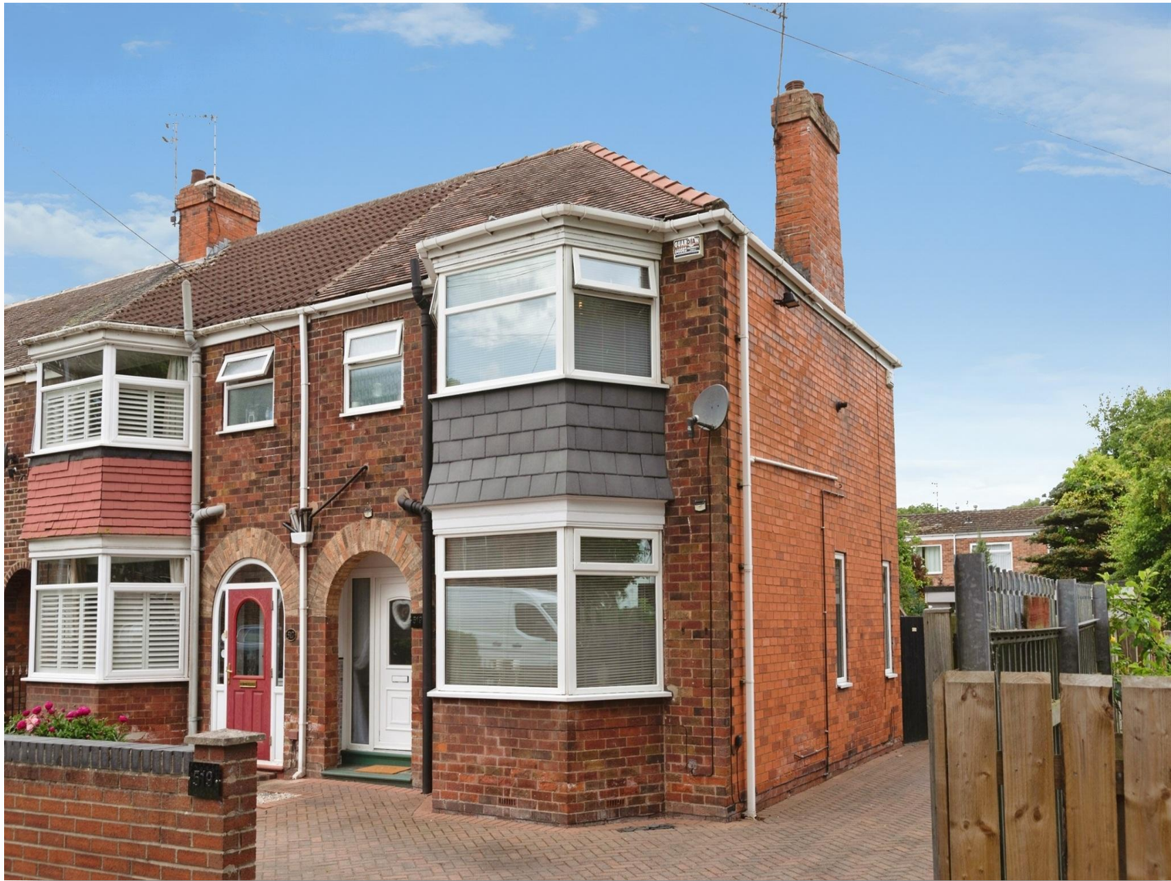
Leads Road, Sutton-On-Hull, Hull, HU7 4XT