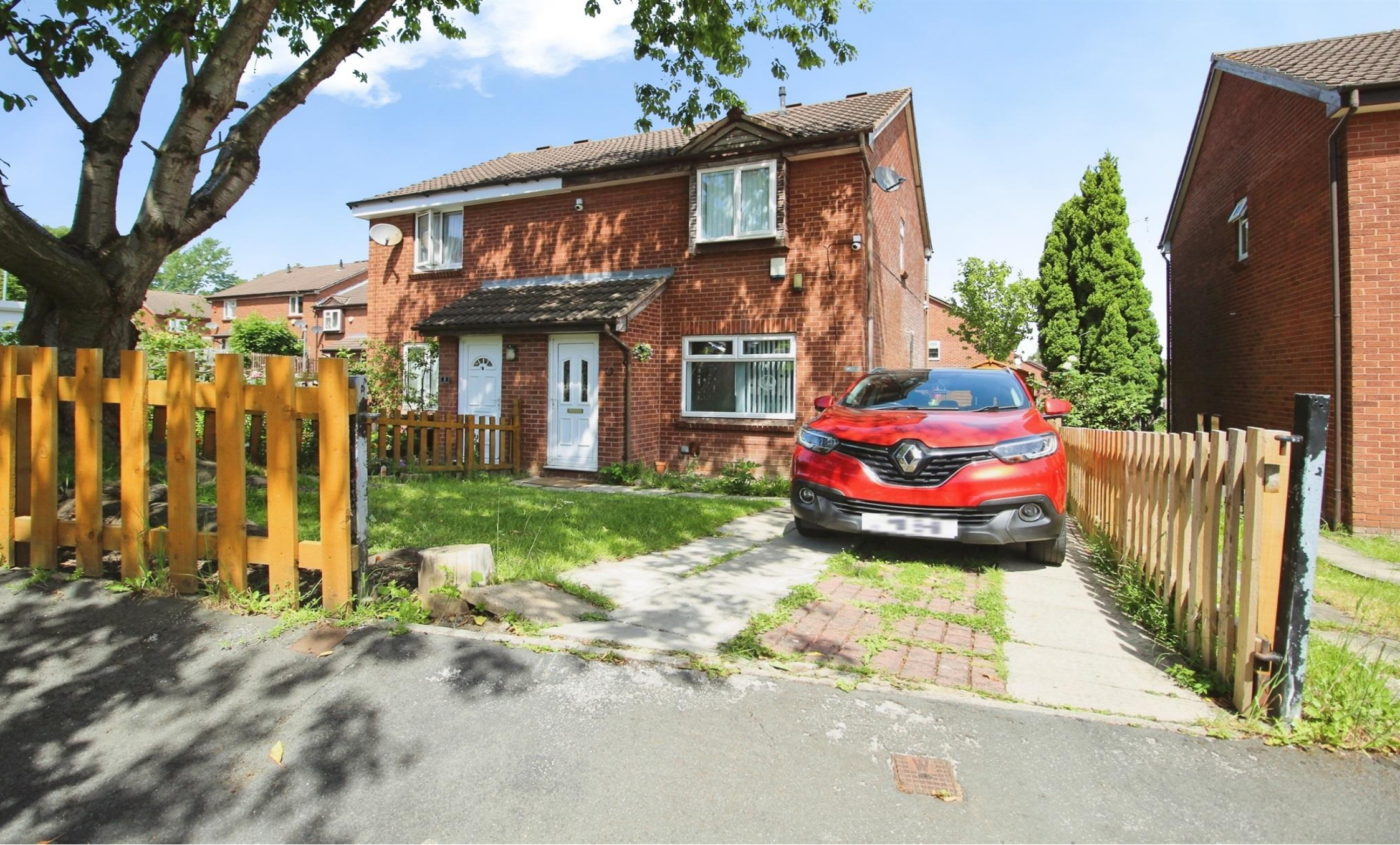
Livinia Grove, Leeds LS7 1LH

Not for marketing purposes INTERNAL USE ONLY