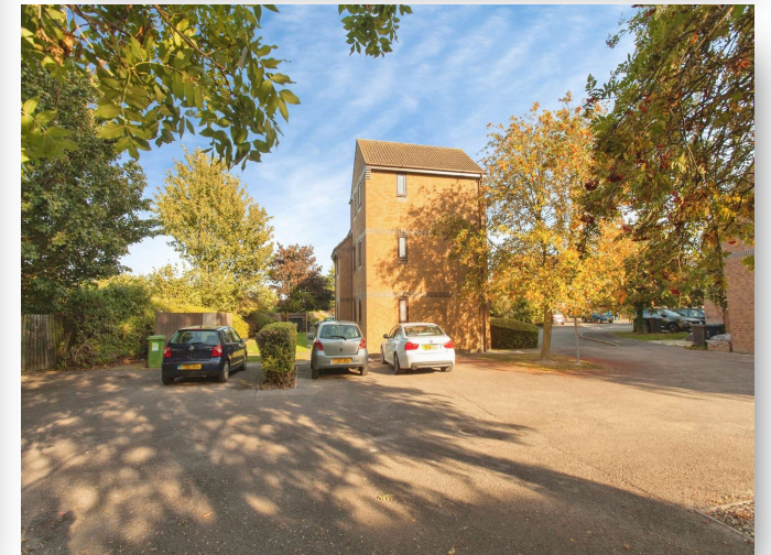
86 Lucerne Close, Cambridge, CB1 9SA