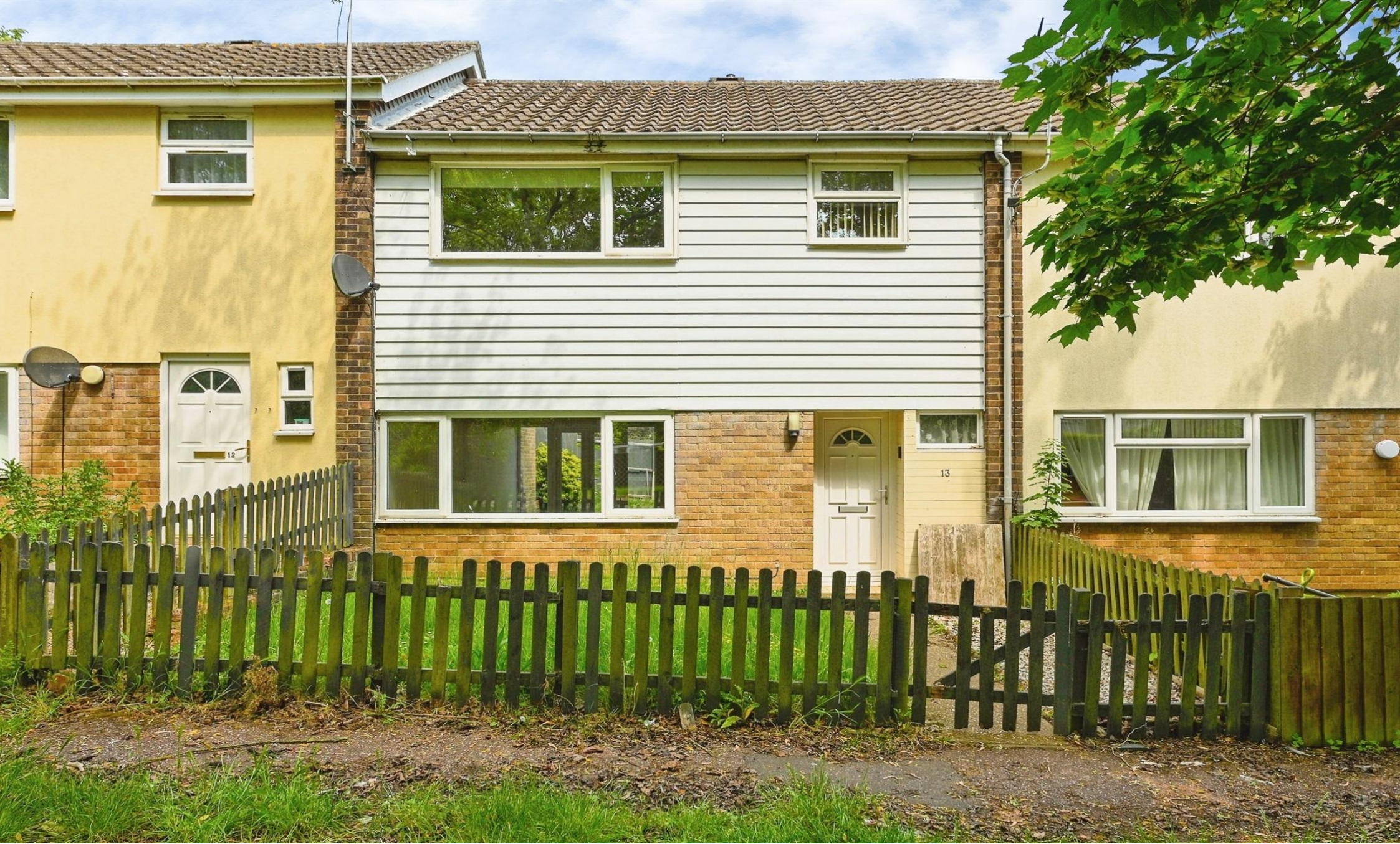
Eastfields, King's Lynn, PE30 4SF