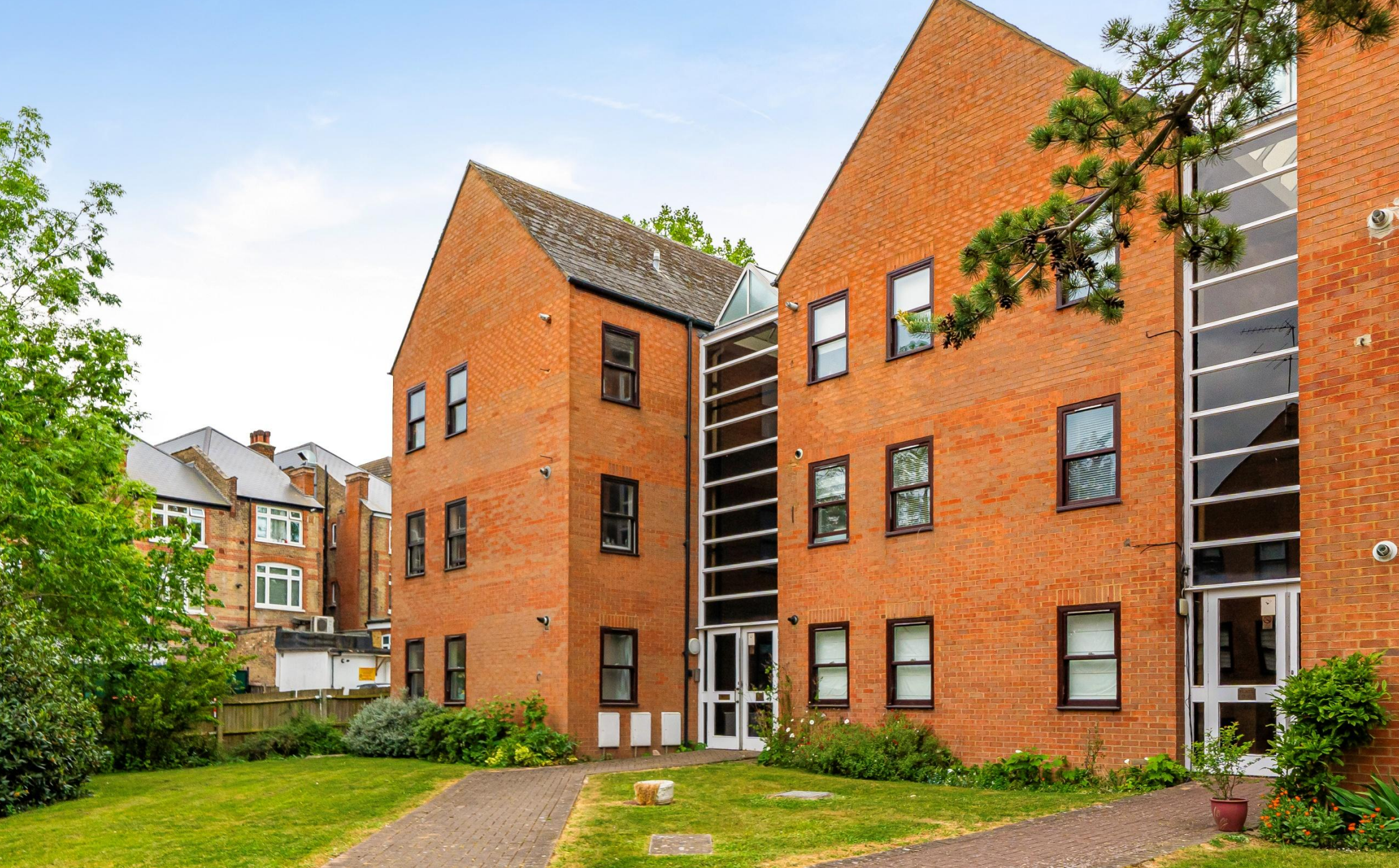
Bennets Lodge, Chase Court Gardens, Enfield, EN2 8DB