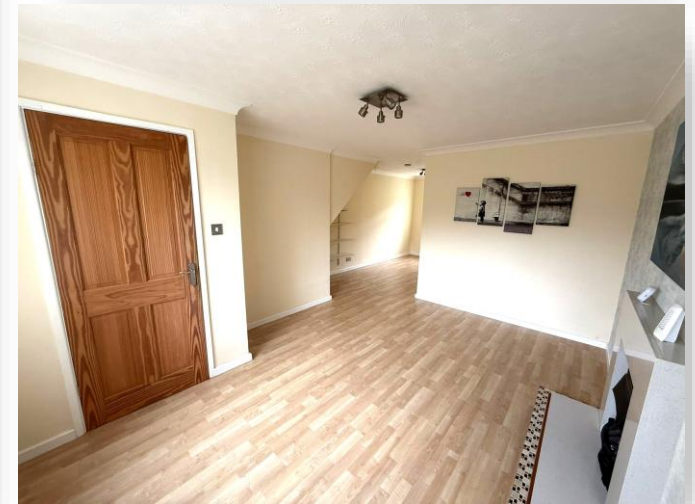
Ravensthorpe Drive, Loughborough