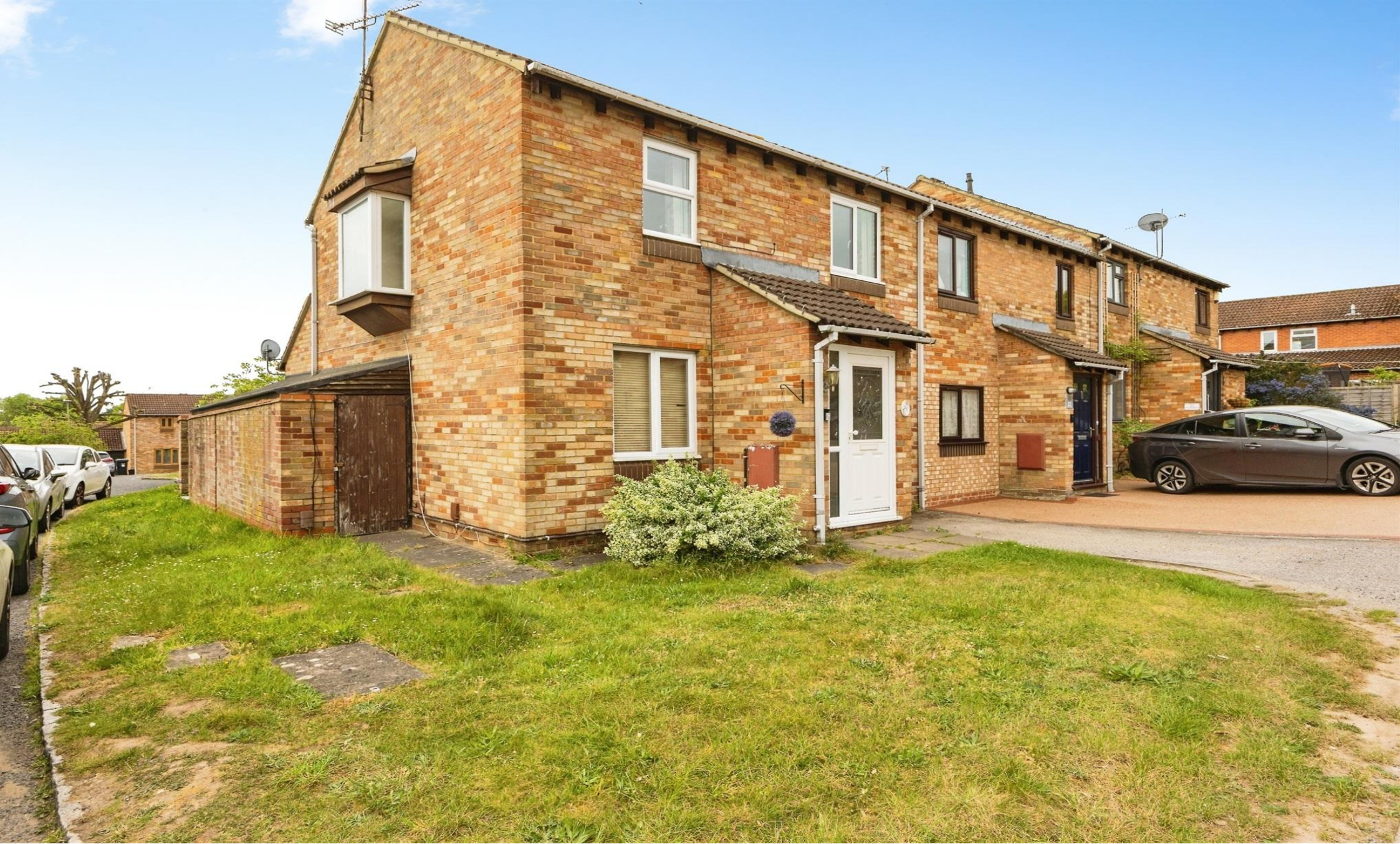
Ravenglass Close, Lower Earley Reading RG6 3BX