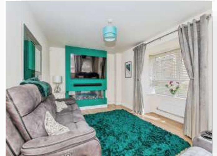
Aqua Drive, Hampton Water Peterborough PE7 8QL