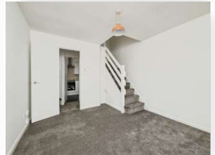
Cookson Close, Yaxley Peterborough PE7 3WN