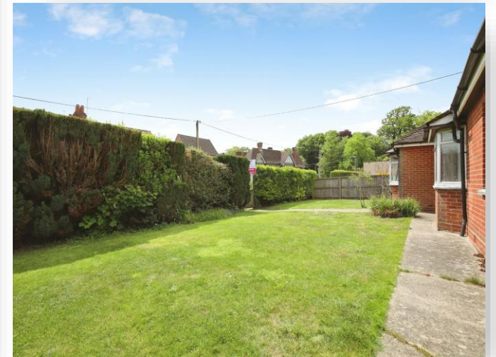
Roseland Avenue, Devizes SN10 3AR