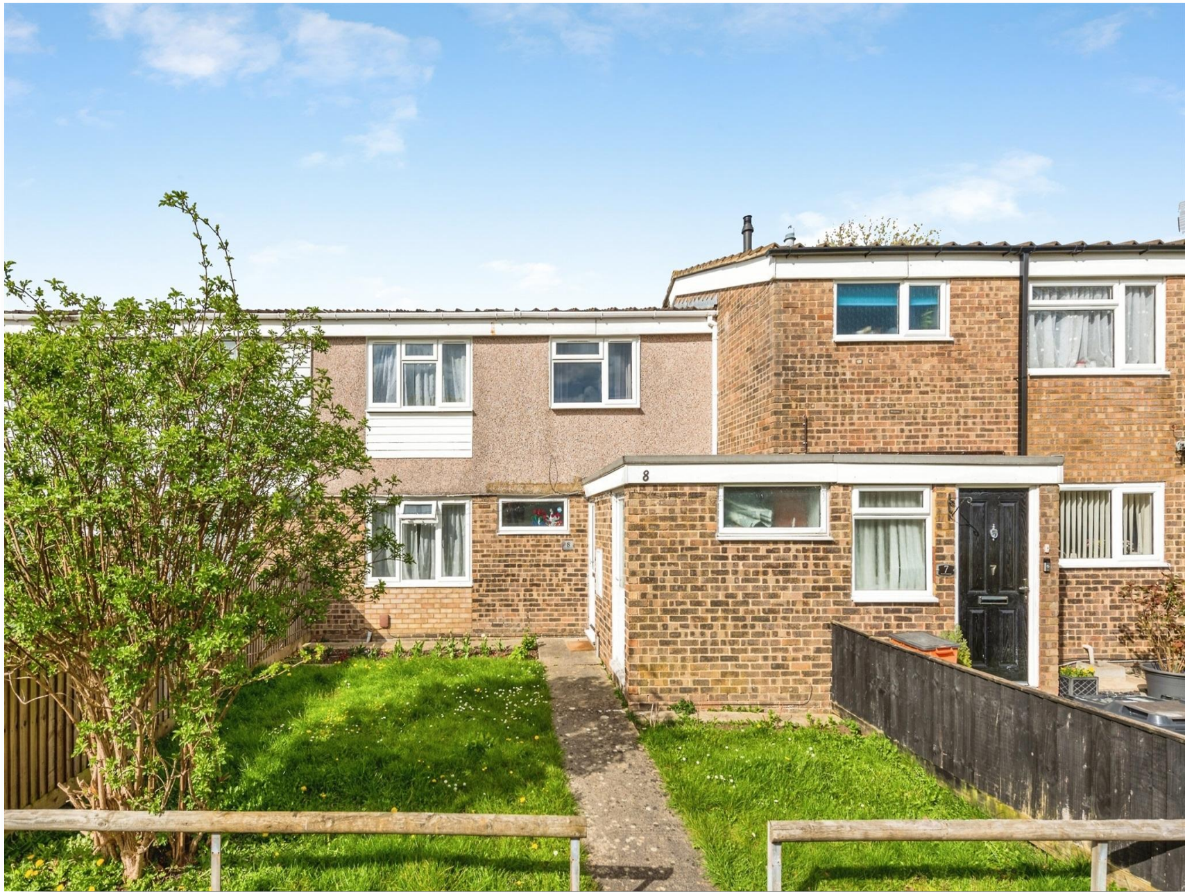
Islandsmead, SWINDON SN3 3TG