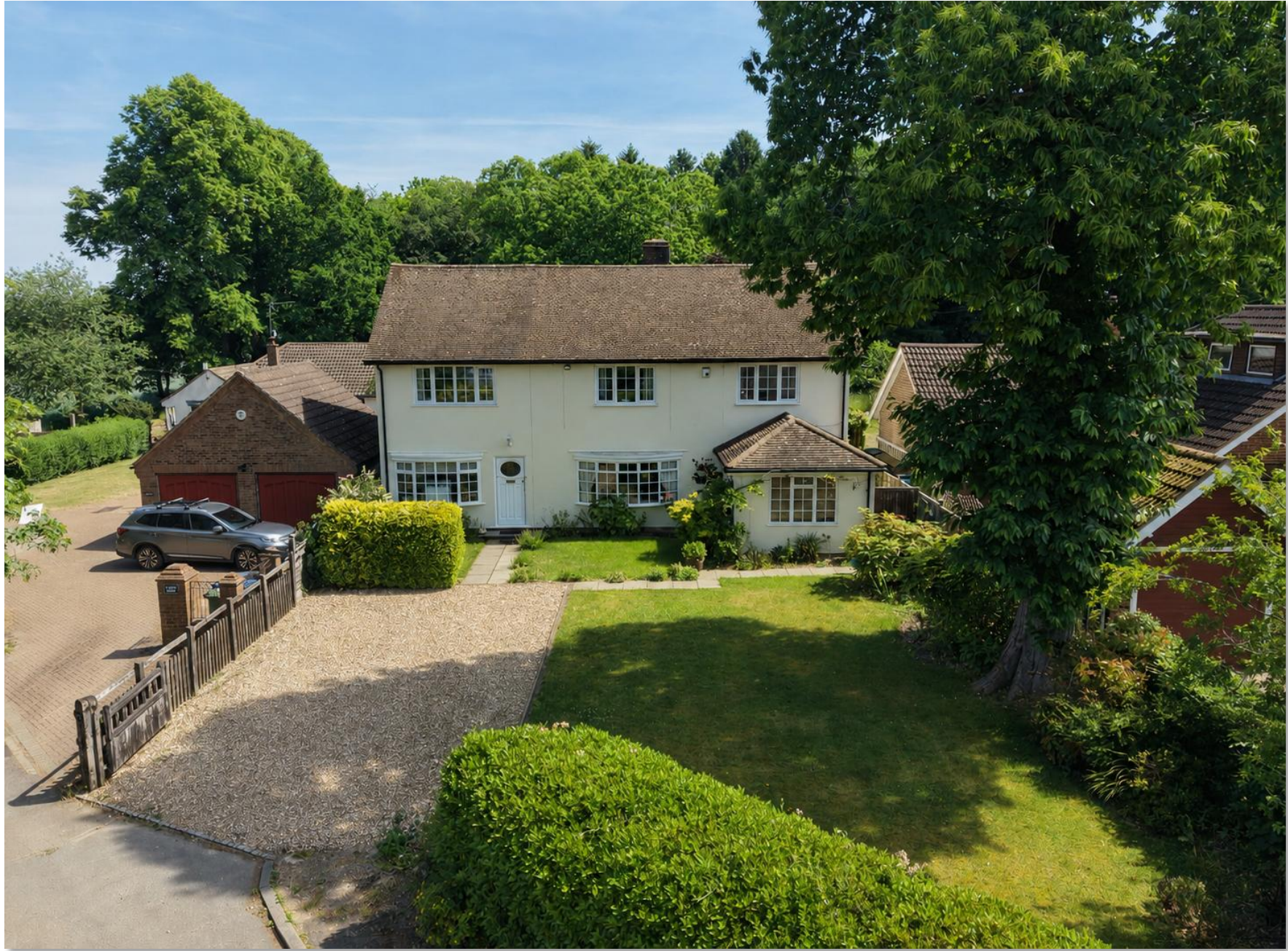
Chestnut House Hollybush Close, Potten End Berkhamsted HP4 2SN