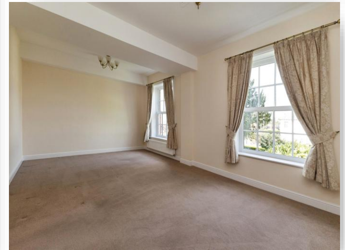
The Old College Roman Road, Middlesbrough TS5 5PQ