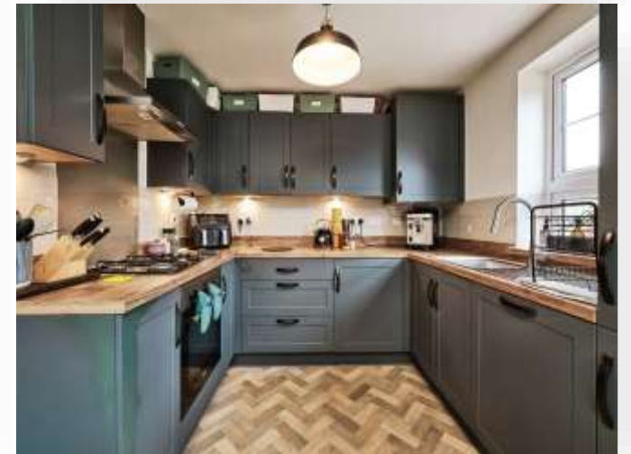
Fonthill Close, Hampton Water Peterborough PE7 8TL