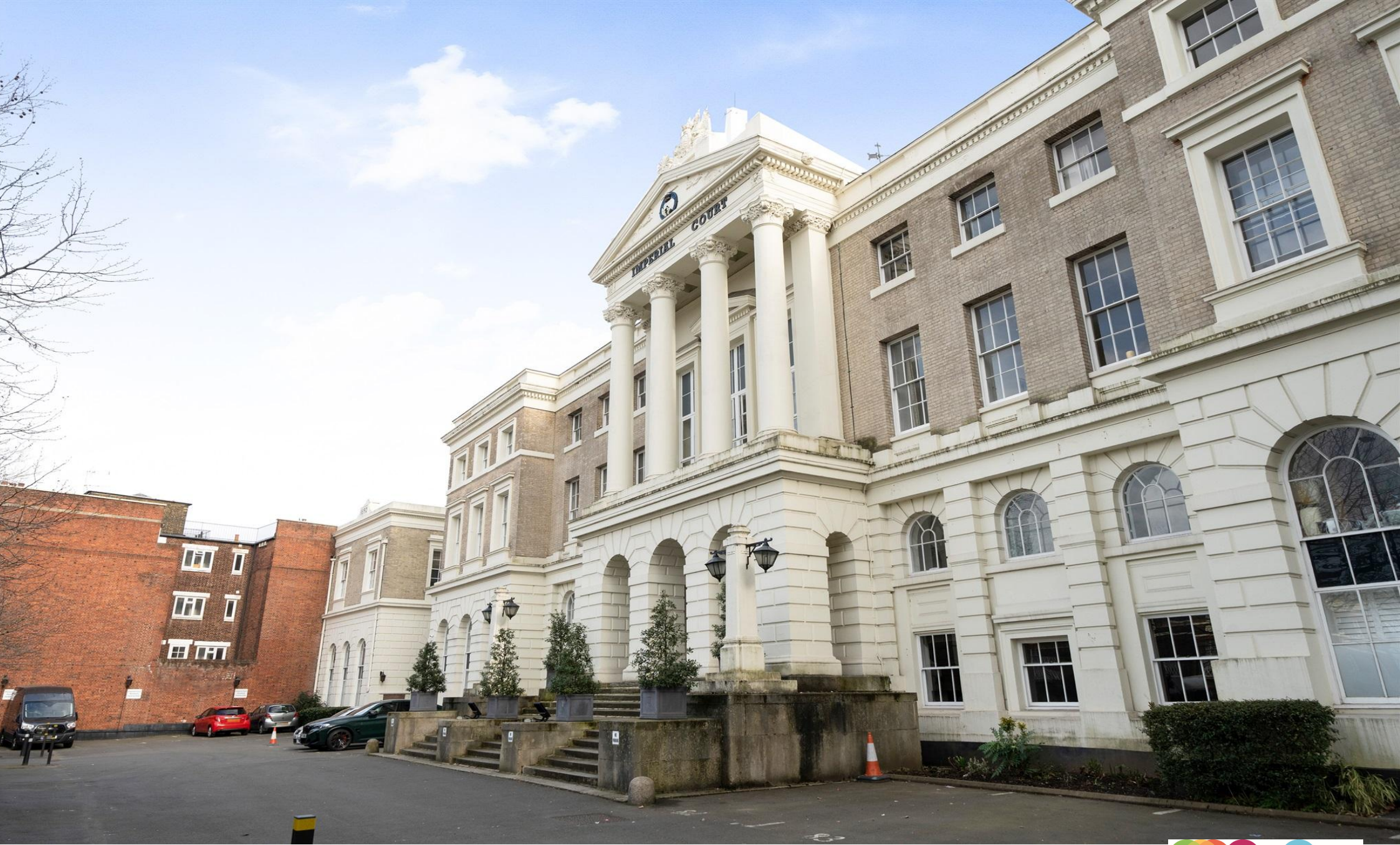
Imperial Court Kennington Lane, London SE11