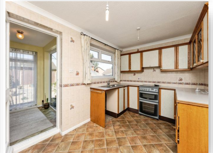
South Hill Rise, Leeds LS10 4SQ