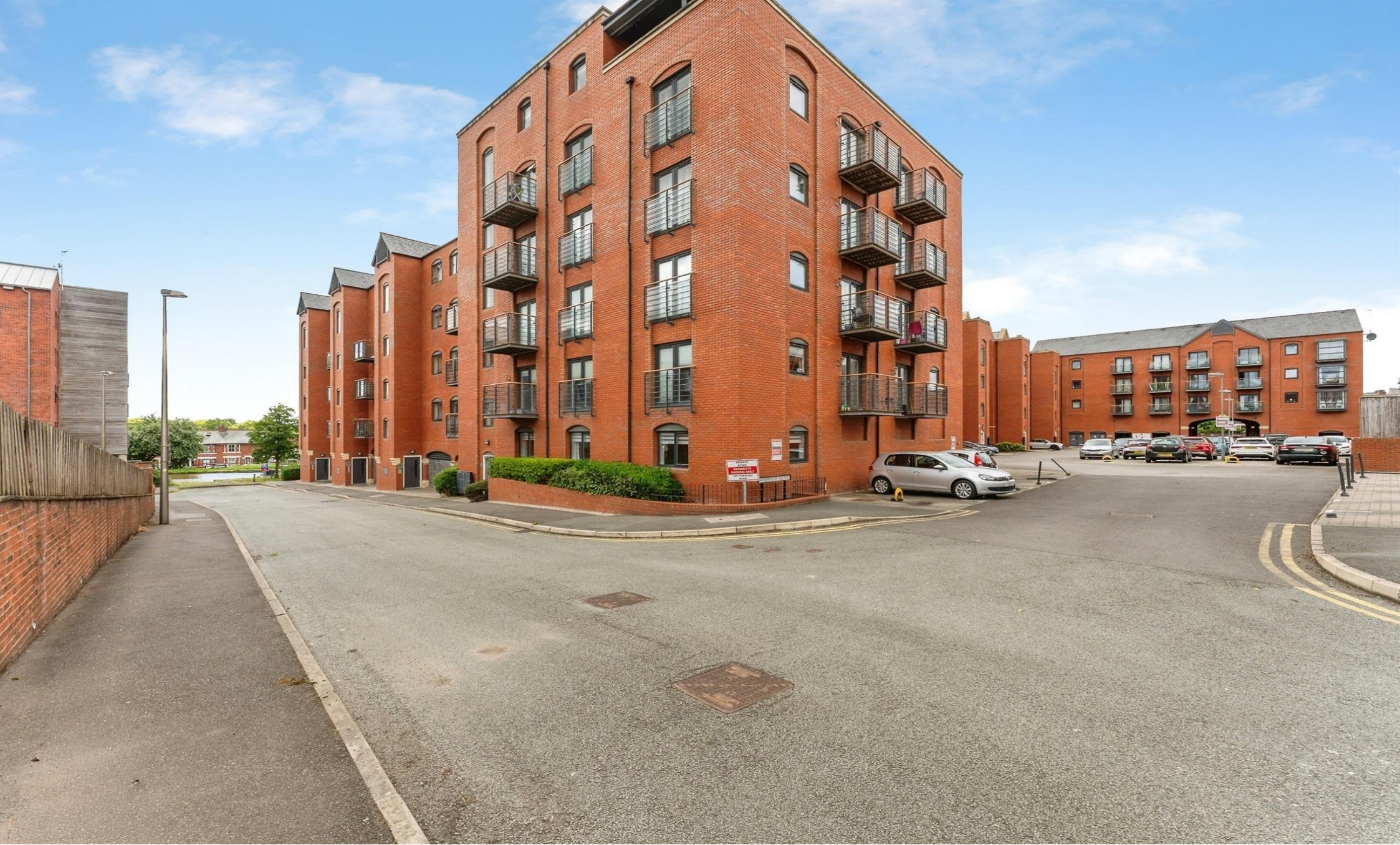
Wharf View, Chester CH1 4GW

Not for marketing purposes INTERNAL USE ONLY