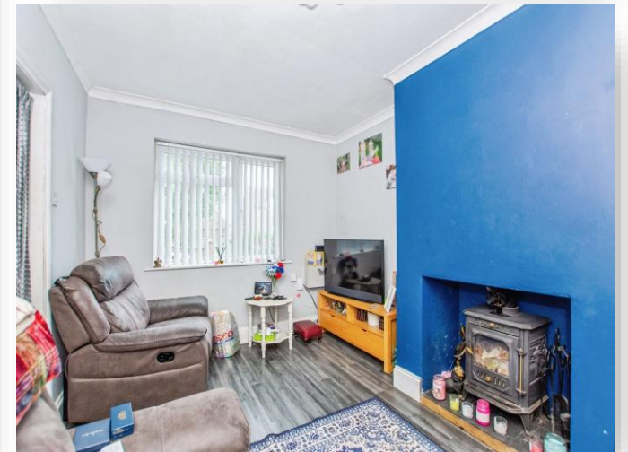
School Road, West Walton Wisbech PE14 7HA