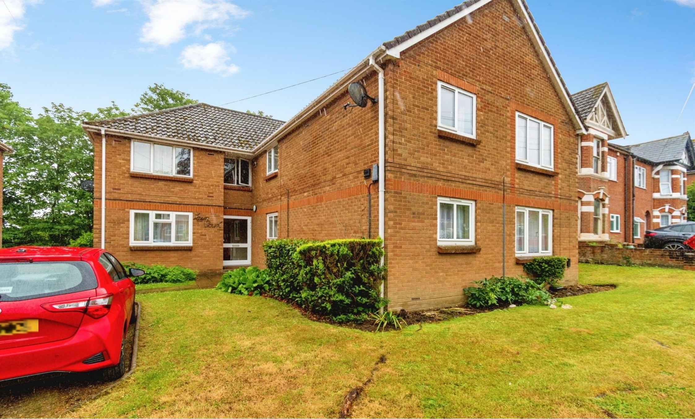
Lawn Court, Lawn Road, Southampton SO17 2EY