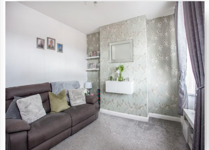
Crossland Street, Swinton Mexborough S64 8BB