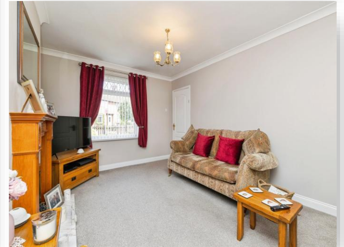
Station Crescent, Billingham TS23 1LY