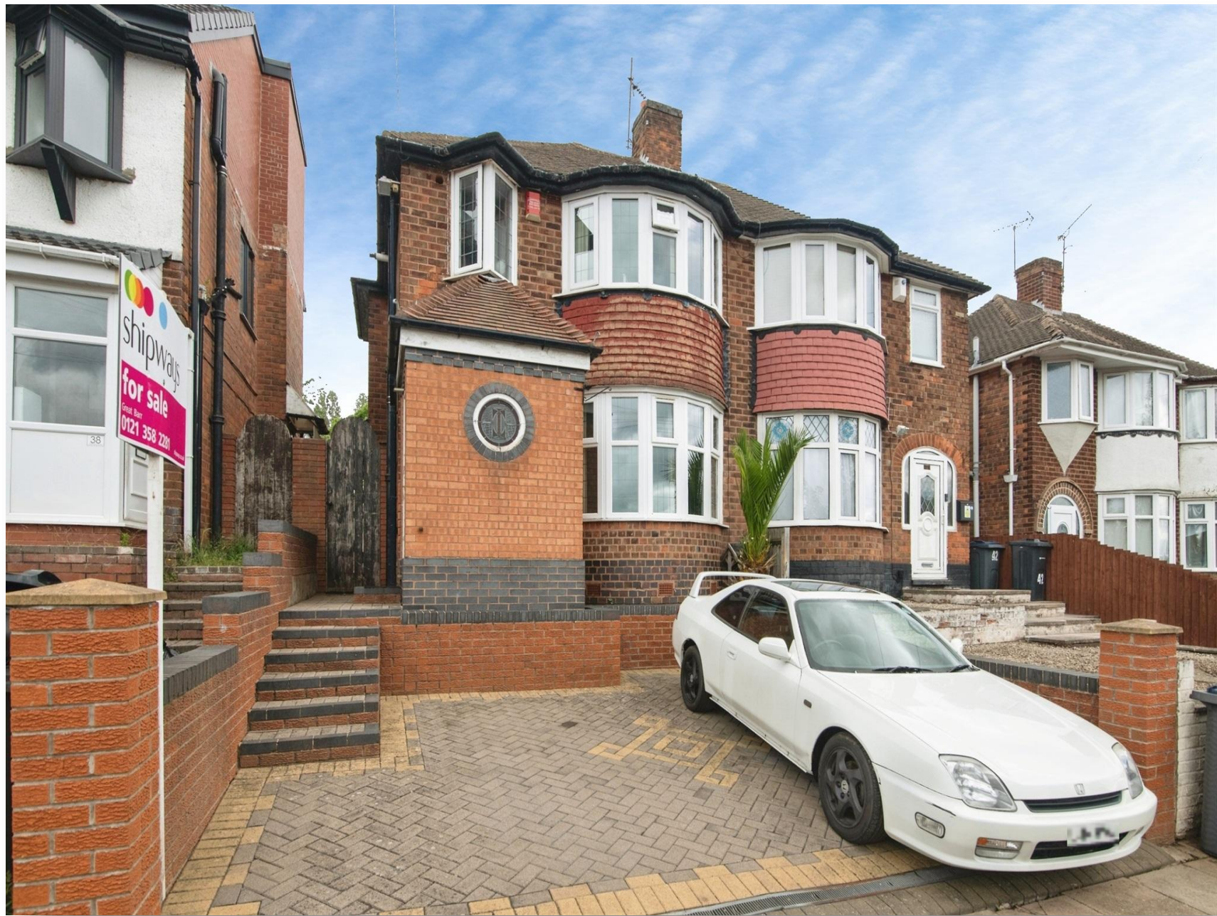
Dorrington Road, Birmingham B42 1QS