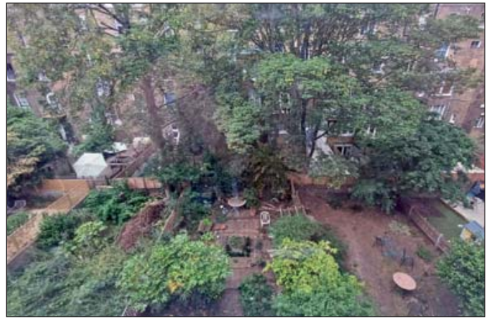
View from flat