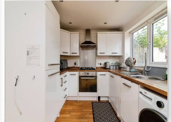
Ashness Close, Gamston Nottingham NG2 6QW