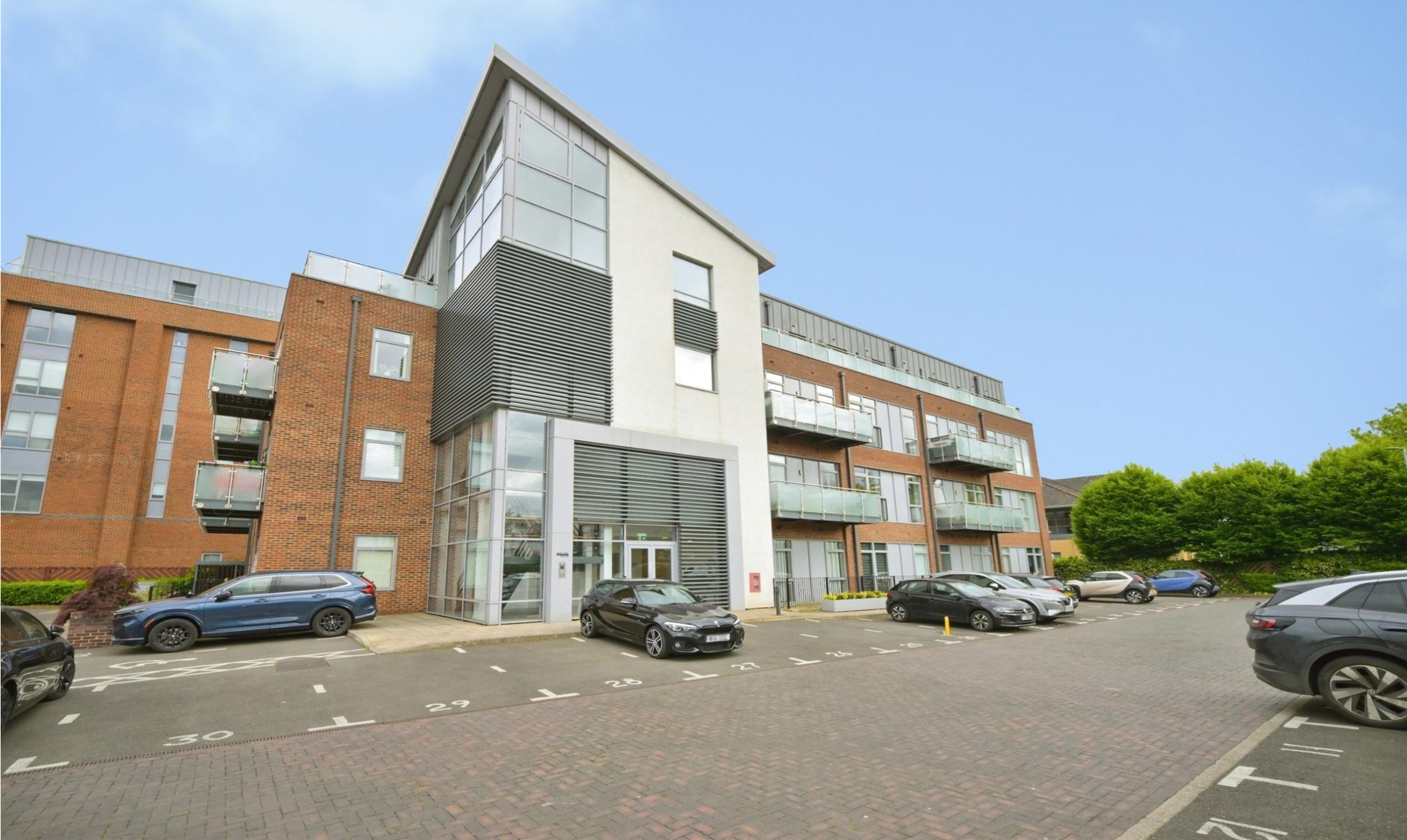
Mercury House Broadwater Road, Welwyn Garden City AL7 3FB