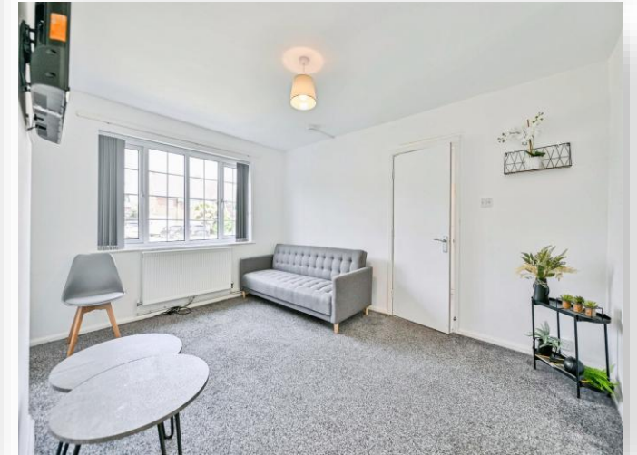
Spinney Close, West Bridgford Nottingham NG2 6HH