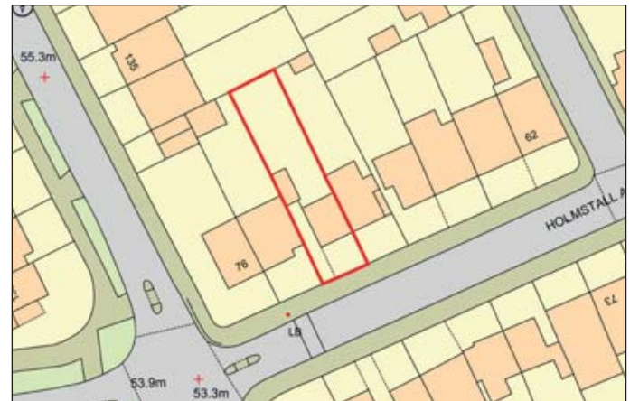
©Crown Copyright. Licence Number: ES 100020372

Strictly by arrangement with the auctioneer. Please see important advice for viewers on page 19 of this catalogue.