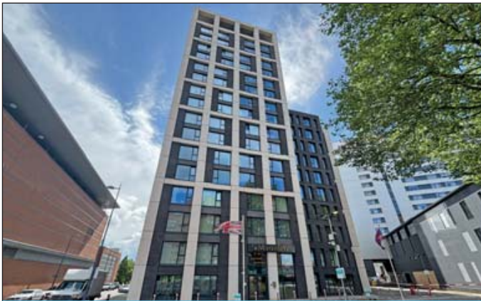
All enquiries Ref: Brian Grante