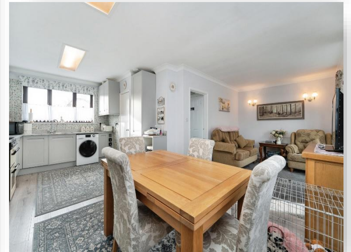
Short Lane, Feltwell, Thetford, IP26 4BH