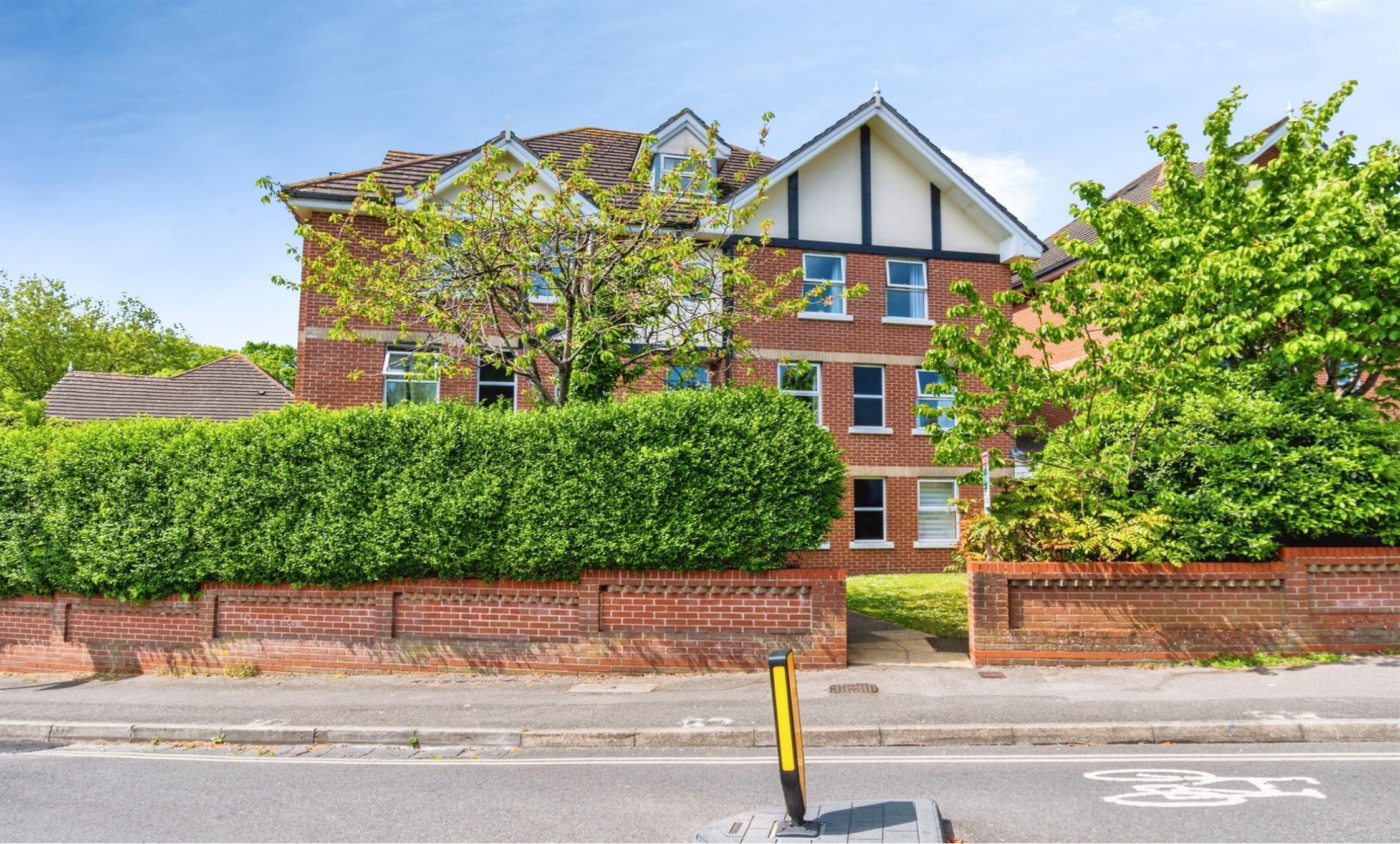
Blenheim House, Westridge Road, Southampton SO17 2HR