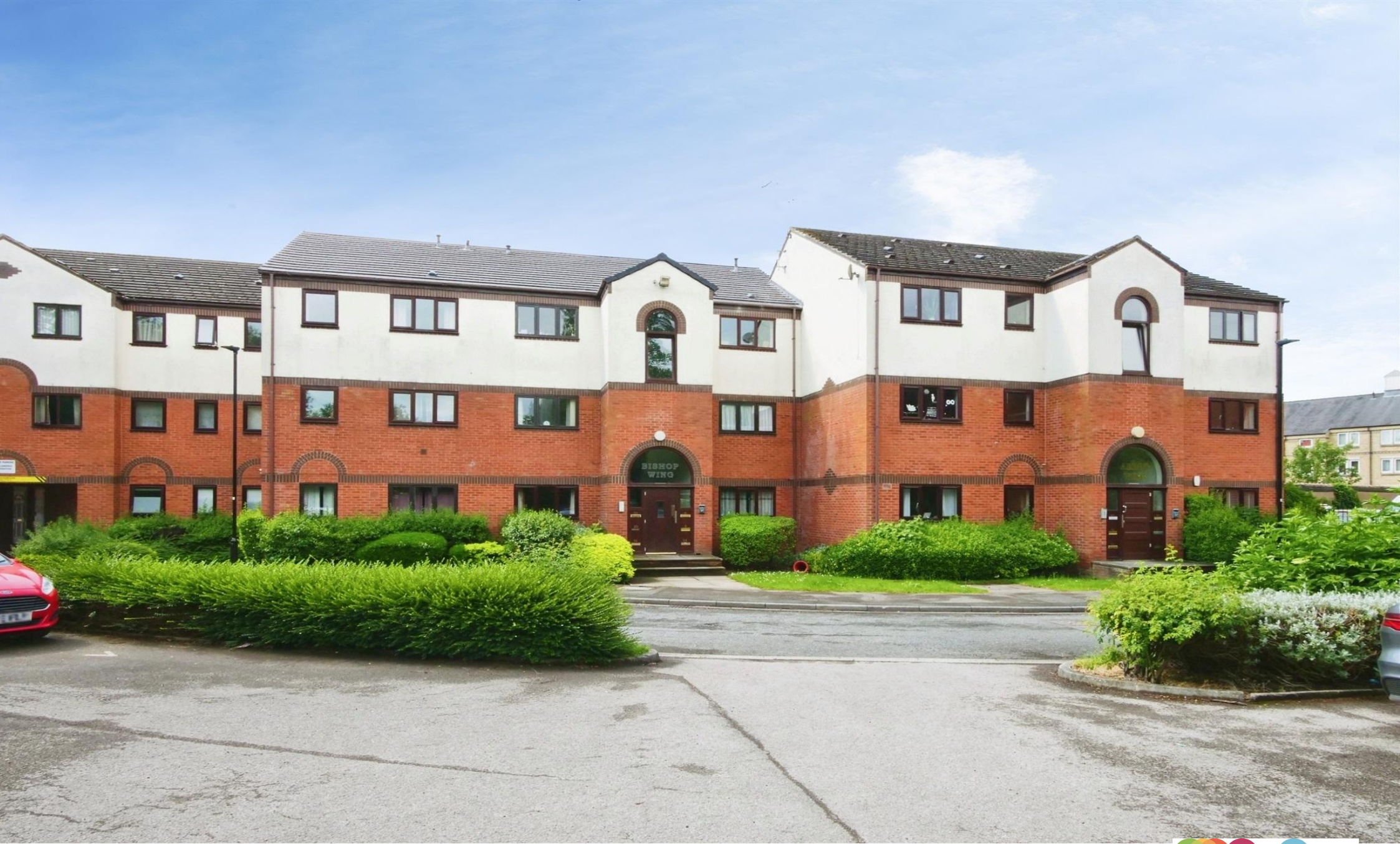
Beckside Gardens, York YO10 3TX