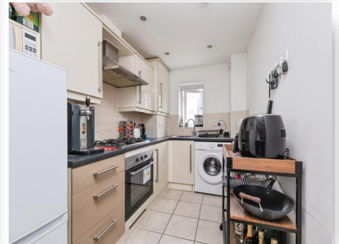
Cavan Way, Broughton, Milton Keynes, MK10 9LY