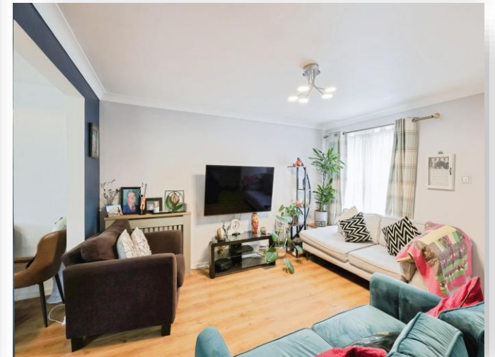
Copymoor Close, Wootton, Northampton NN4 6BL