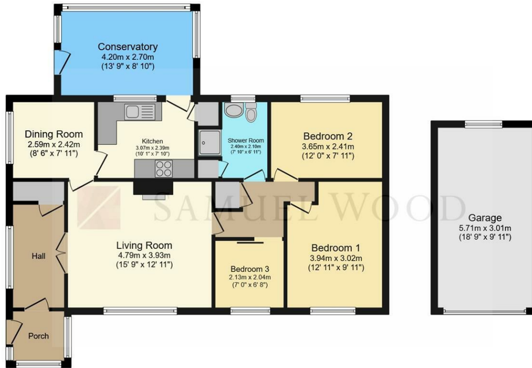
Floor Plan Floor area 91.3 sq.m. (982 sq.ft.)