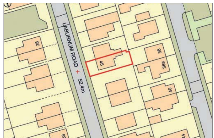
Licence Number: ES 100020372

Strictly by arrangement with the auctioneer. Please see important advice for viewers on page 19 of this catalogue.