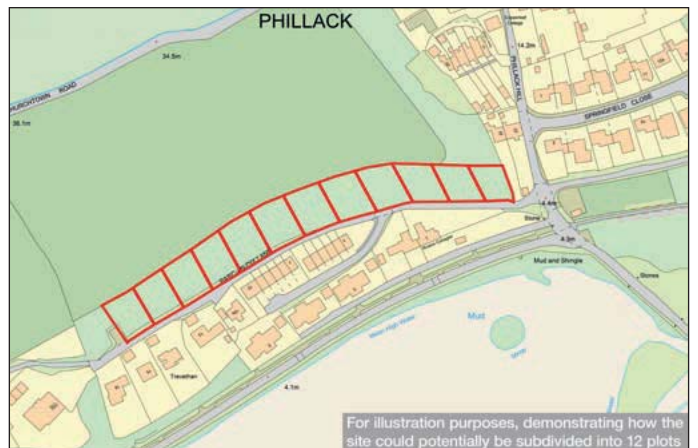
For illustration purposes, demonstrating how the site could potentially be subdivided into 12 plots