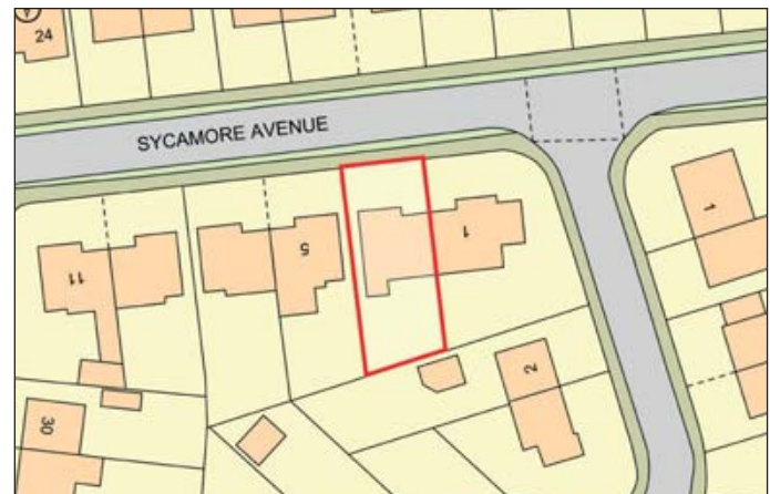
Licence Number: ES 100020372