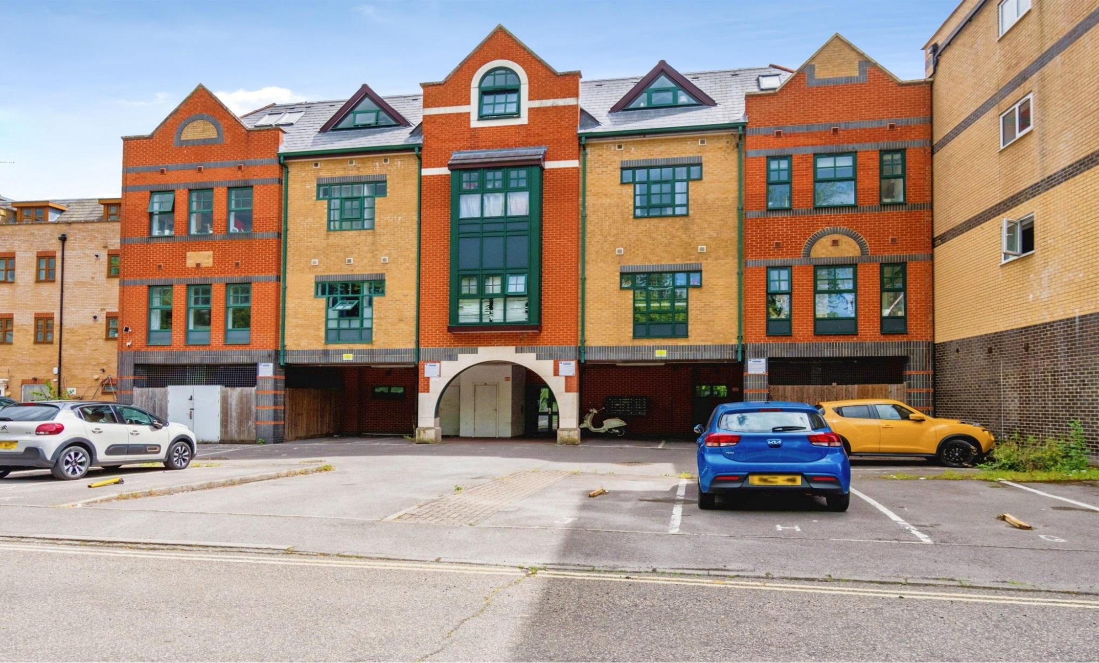
Hampton House, St. Marys Place, Southampton SO14 1AZ