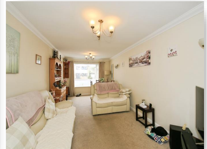
Waterton Close, Deeping St. James Peterborough PE6 8PN