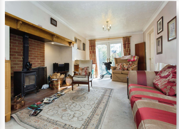
15 Plumian Way, Balsham, Cambridge, CB21 4EG