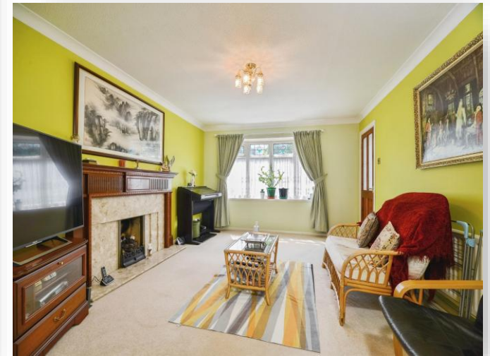
Greens Grove, Stockton-On-Tees TS18 5AW